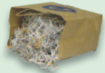
Paper bags & shredded paper (Place in a paper bag)