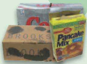
Cereal & shoe boxes soda & beer cartons