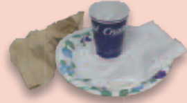
Paper towels, plates & napkins