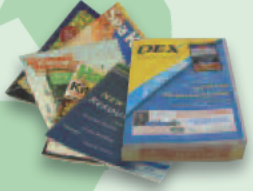
Magazines, catalogs & phone books