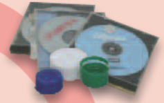
Lids, caps & tops, CDs