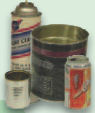
Aerosol & tin cans