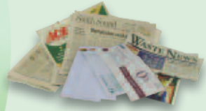
Newspapers & junk mail