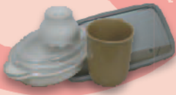
Mirrors, pyrex & ceramic