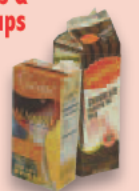
Milk cartons & drink boxes

If an item is reusable, please consider donating it or reusing the item before discarding it into the garbage.