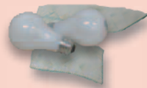
Light bulbs & window glass