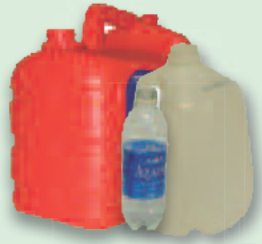
Plastic bottles & jugs