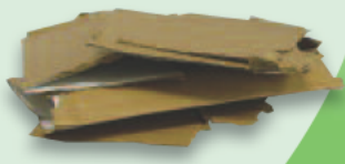
Cardboard (please flatten)