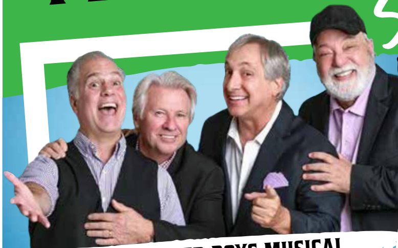
THE BOOMER BOYS MUSICAL JANUARY 27 | 8PM

Off-Broadway National Tour stops in Fairfield!