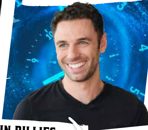
TRIPPIN BILLIES MAY 5 | 8 PM

America's most renowned Dave Matthews tribute band!