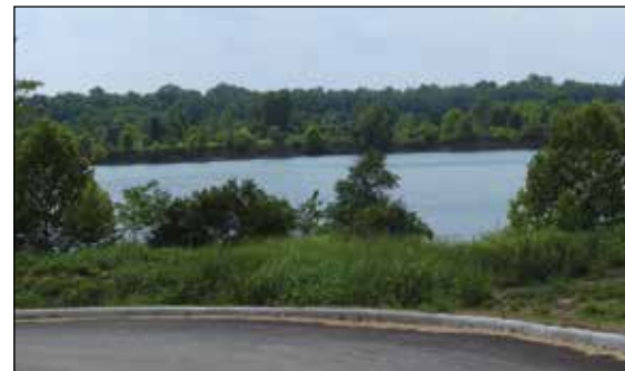
View at the entrance to FurField

Watch the City's social media outlets and website for the date of the grand opening!