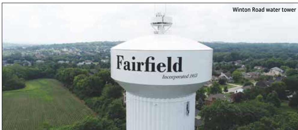
Winton Road water tower

The Public Utilities Department has completed several projects over the past few months as part of its ongoing commitment to invest in the City's critical water infrastructure. The Department's primary goal is to provide the community with a reliable supply of drinking water which is imperative to public health and safety.