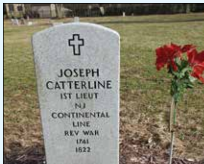
Revolutionary War soldier gravestone