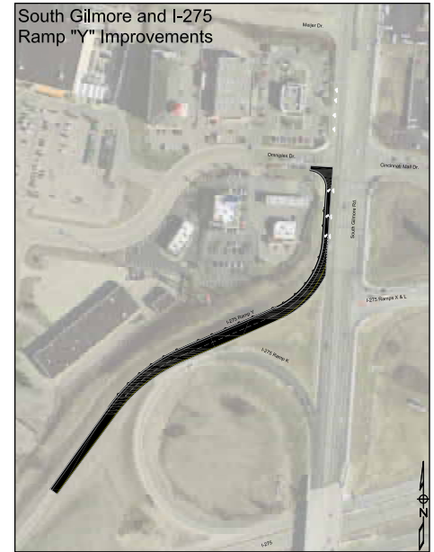
Project location map

The City of Fairfield is investing in this project in order to reduce congestion during the evening rush hour.