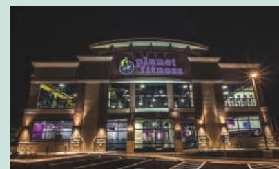
Planet Fitness in Florence.

Additional redevelopment on Patterson Drive is expected once Planet Fitness moves out.