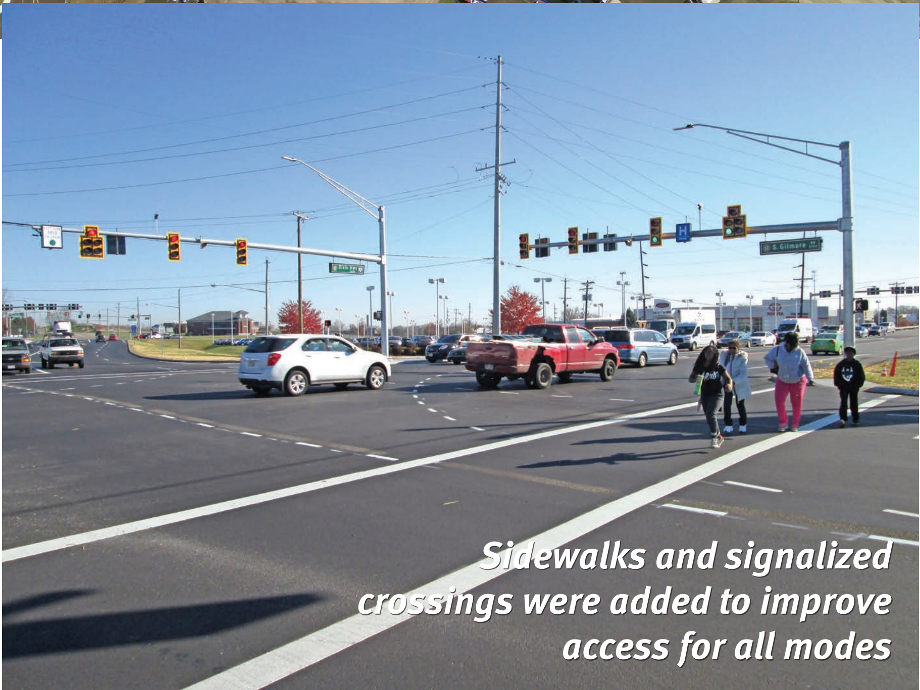
Sidewalks and signalized crossings were added to improve access for all modes

This project upgraded a critical arterial in Fairfield, Ohio, at its intersection with State Route 4 through applying sustainability best practices. The project improved the safety and capacity at this intersection by widening and realignment of Gilmore Road and Holden Boulevard to add a southbound through lane while maintaining left turn lanes. This intersection—previously one of the city’s most dangerous—was improved with minimal impacts to adjacent commercial properties. The pedestrian environment was also significantly enhanced through the addition of new and widened sidewalks.