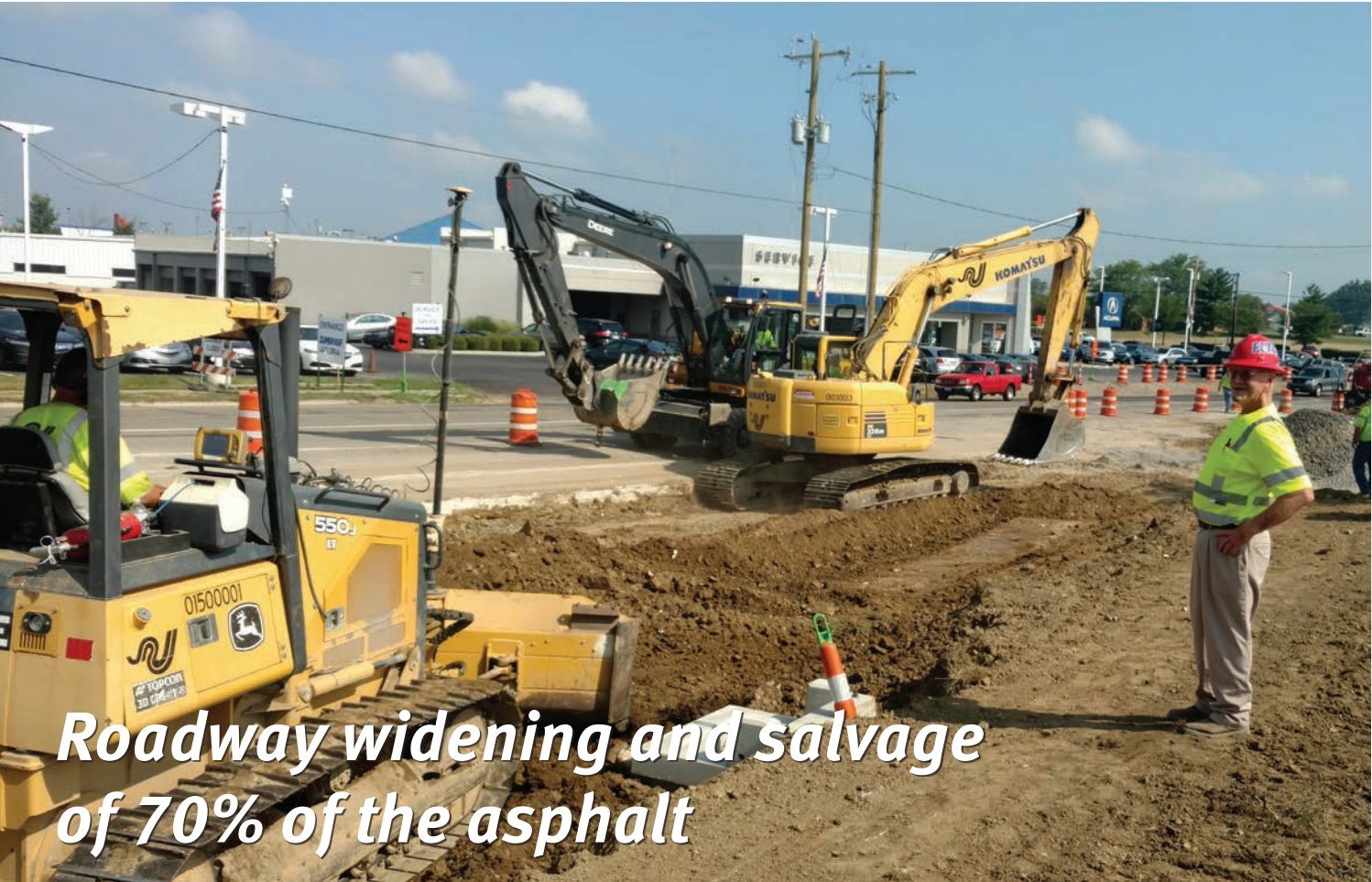
Roadway widening and salvage of 70% of the asphalt