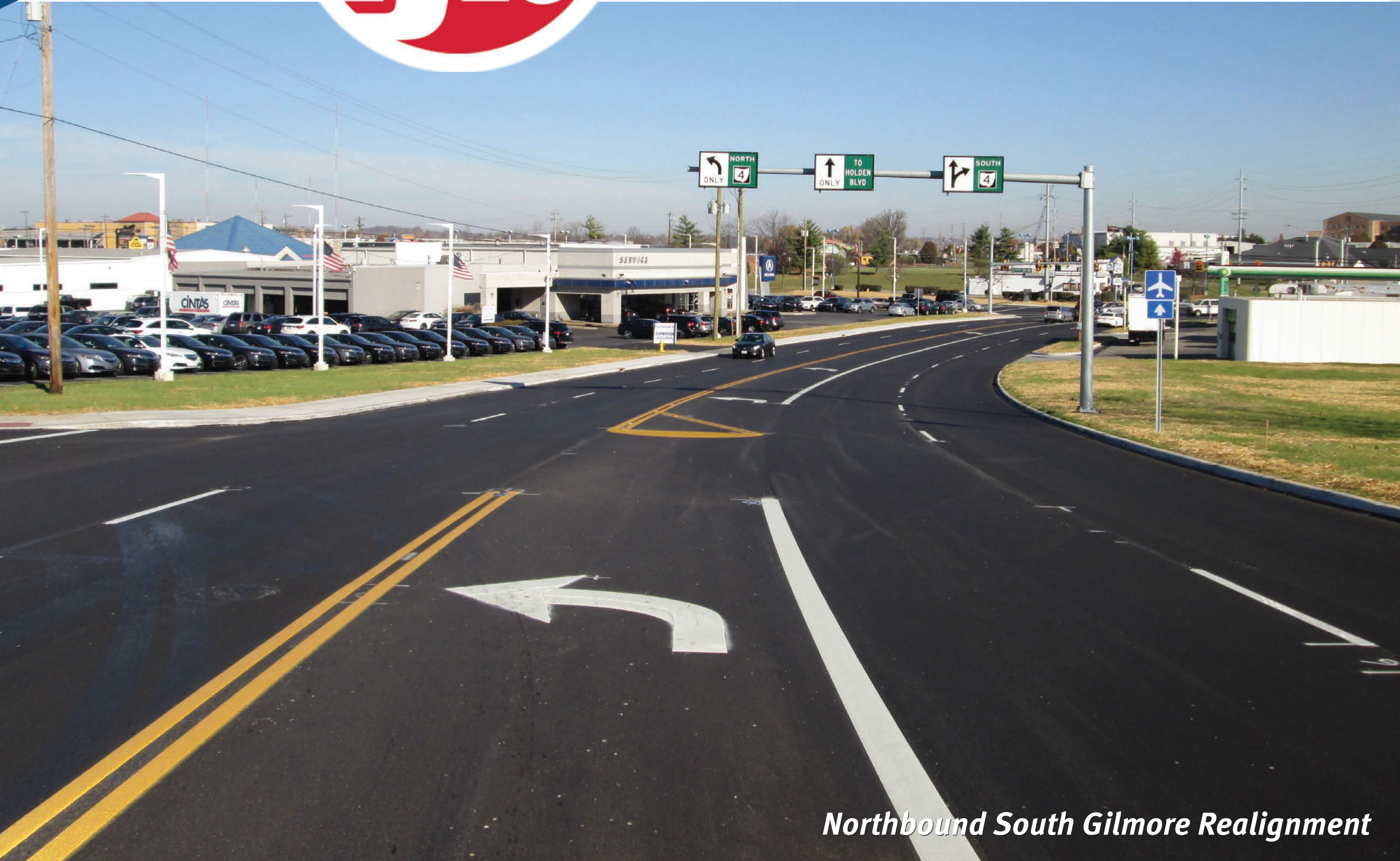
Northbound South Gilmore Realignment

ACEC AMERICAN COUNCIL OF ENGINEERING COMPANIES of Ohio