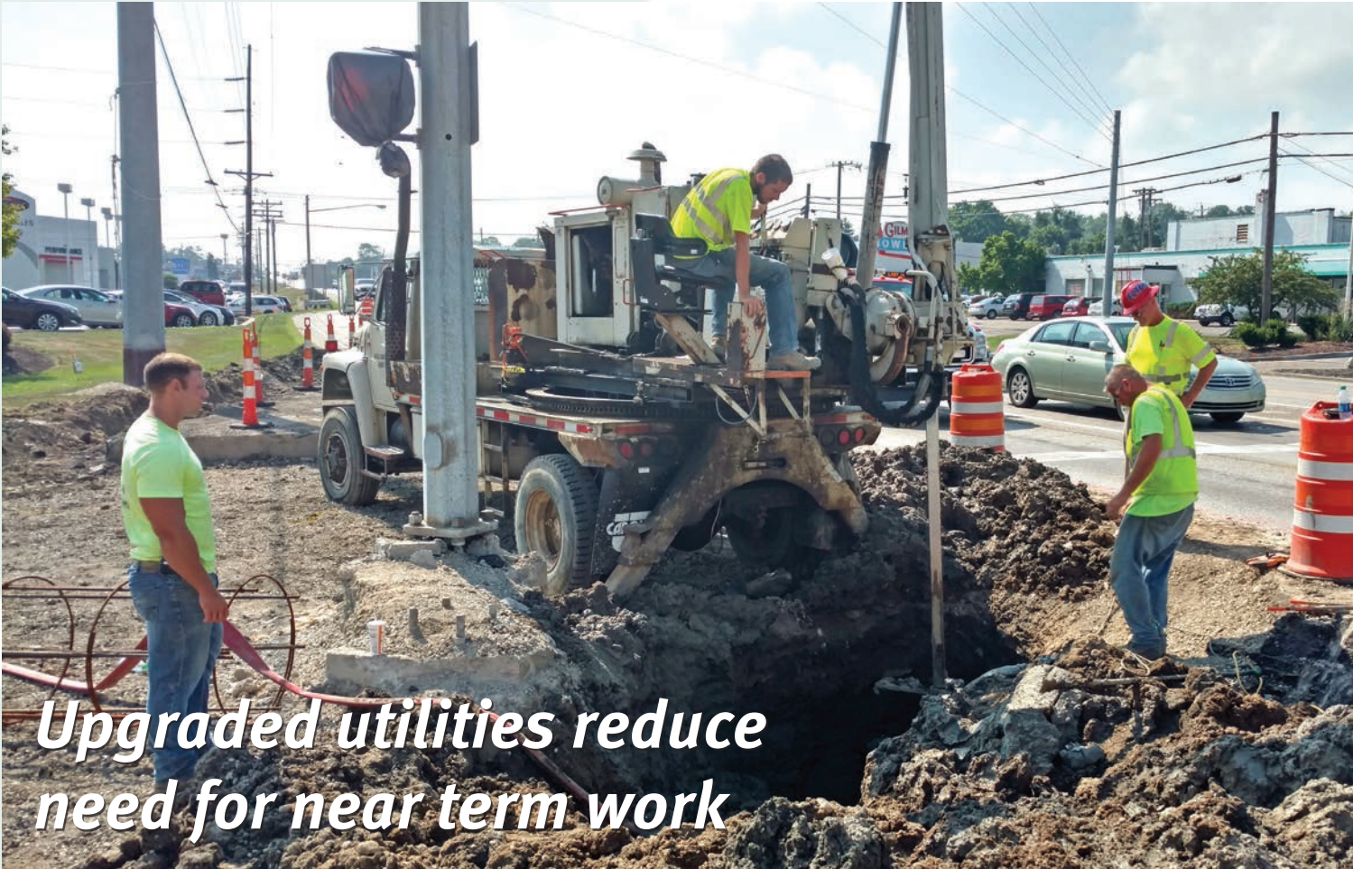
Upgraded utilities reduce need for near term work