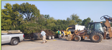
MONTHLY BRUSH DROP-OFF