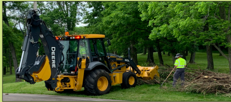
CURBSIDE LIMB PICKUP PROGRAM