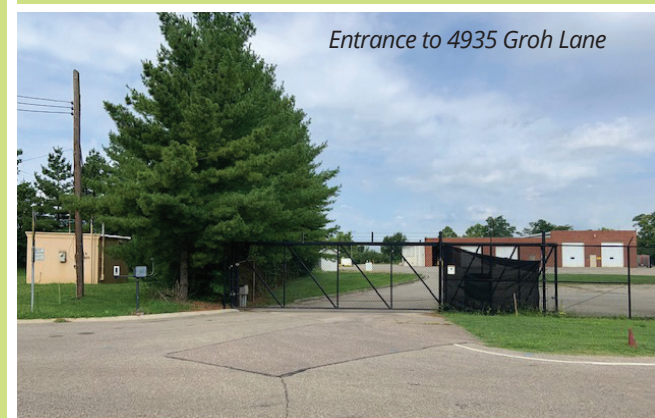
Entrance to 4935 Groh Lane