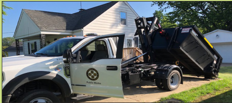
BRUSH DUMPSTER PROGRAM